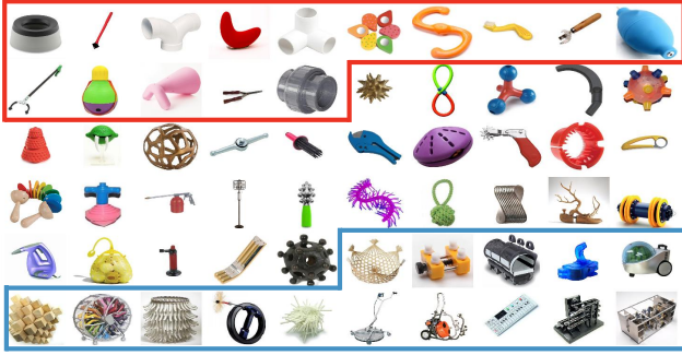
Figure 3: Novel objects sorted by mean complexity rating. Top left object corresponds to the lowest-rated object, and the bottom right object corresponds to the highest-rated object. Objects from the bottom (red) and top (blue) quartile were used as stimuli in Exp. 2 and 3.