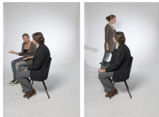
1. A girl was arguing with a boy. Subsequently... 2. The boy got really annoyed.