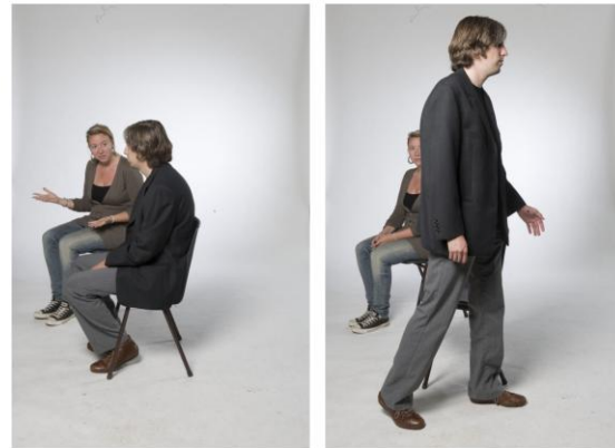
1. A girl was arguing with a boy. Subsequently... 2. The boy got really annoyed.

press), accompanied by two introductory sentences and the onset of a third sentence. The first picture of a pair always showed one male and one female person sitting next to each other. In the second picture, one of these persons performed an action, such as walking away or getting a glass of water. This person will be referred to as the target character, as participants were expected to refer to this character in their continuations. There were two versions of each picture pair; one in which it was the male person and one in which it was the female person that performed the action. An example of a picture pair is shown in Figure 1.