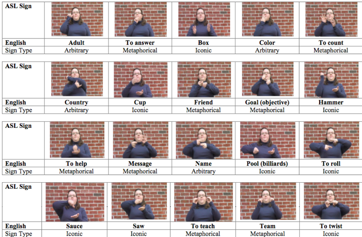
Figure 2: ASL signs and English words used in study, listed by sign type.

their native language and unfamiliar second languages when they enact iconic gestures representing the words' meanings (Tellier, 2005, 2008).