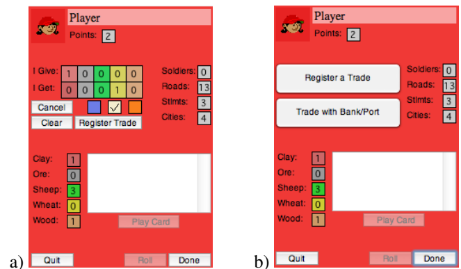
Figure 2: (a) A player’s hand panel in JSettlers. (b) The modified hand panel during normal game play. Trade is agreed via the chat interface prior to using the panel to register the trade.

In contrast to other task-oriented dialogues, e.g., the map task (Anderson et al., 1991; Guhe & Bard, 2008), The Settlers